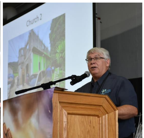
Many presenters came to the podium from financial advisors to African missionaries to board sub-committee members.