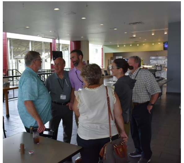
The wonderful lunch buffet prepared by Fairmont State University provided more time for sweet fellowship.