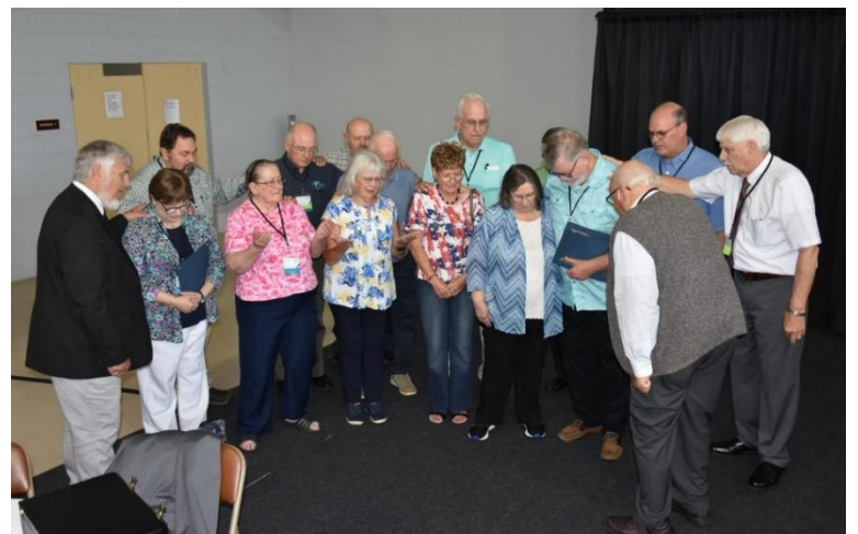
The Conference ended as we added two more pastors and another church to the CBC family! Glory to God for a blessed conference and continued growth.