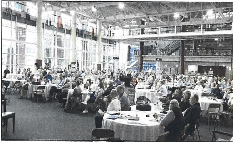
2022 conference at FSU

If you have any questions, please contact the CBC Office at 304-534-8010. All registration is online through the CBC website, covenantbrethren.org