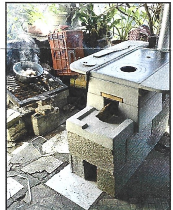
New plancha cookstove and old open fire cooking used every day.

During the day our dental team saw a total of about 500 people, doing fillings, extractions, and cleanings. Their equipment had to be hauled in the back of a pickup or on top of an SUV to some of the most remote mountain villages we have ever been to. At the same time the rest of the team passed out 500, 15-pound bags of food and as many Bibles to groups of people, organized by local pastors, to receive them at different locations. One location was extremely remote and required crossing four creeks and a river while traveling down roads that were not much better than creek beds, for almost 5 hours. During each of these stops we installed wood burning cook stoves, 24 in all, that were vented with a flue pipe. That is very important because when people don't have anything