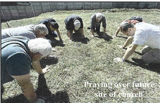
Praying over future site of church

like this they cook in a smoky room over an open fire, breathing in the smoke. Over time the smoke wrecks their kidneys, lungs and livers causing sickness and death even for the children.