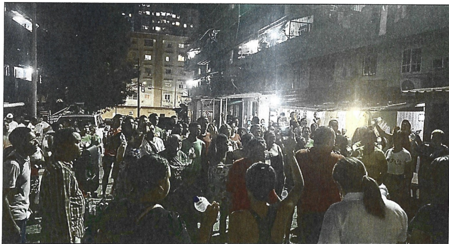
El Chorrillo, Panama

With the help of God, we lead more than 40 people to the Lord Jesus!