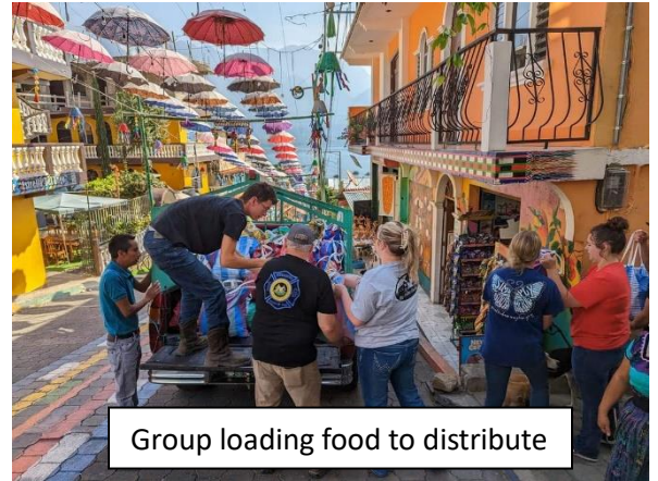
Group loading food to distribute

Guatemala has been one of the blessings of my life. Not just from going myself for over 20 years but in seeing the lives of the people who went along touched forever. I handed a 38-year-old mother of 3 boys, some pictures I found of her on one of our early mission trips. She looked at them