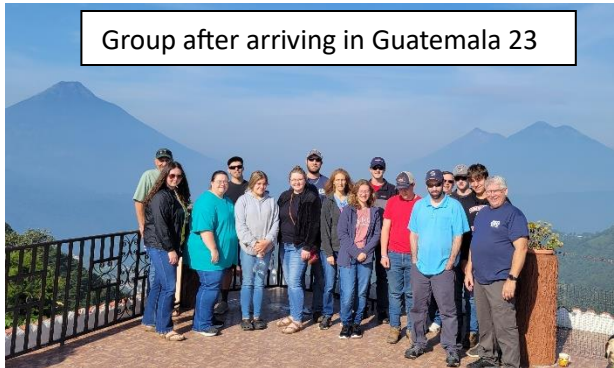
Group after arriving in Guatemala 23