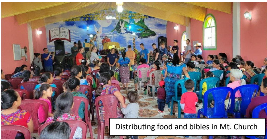
Distributing food and bibles in Mt. Church

So contact me ASAP and let me know if you want to go or know of youth that want to go and we will start on making that dream a reality.