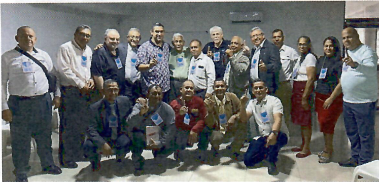
Meeting with Venezuelan pastors.

As we begin a new year with CBC, it seems fitting to pause and reflect on the great things that God led us through in 2025. WOW, what a banner year for our young denomination! This past year we celebrated our fifth anniversary and many of our CBC congregations had special activities to commemorate this milestone.