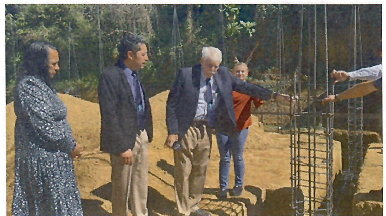
Dedicating the construction site of a new CBC church building in Guatemala

have been excellent Board members and we sincerely appreciate all the hard work they have contributed during these formative years of CBC.