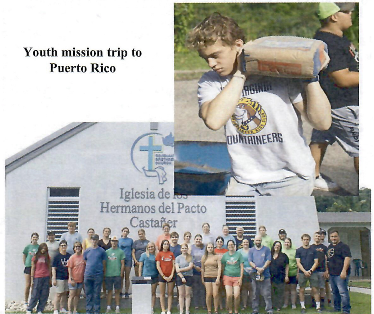
Youth mission trip to Puerto Rico