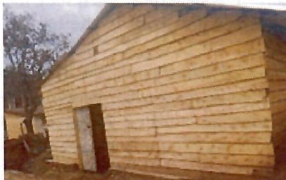
Rebuilt CBC church building in Africa after it was destroyed