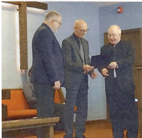
One of the many services where churches were given their new Covenant Agreement to join CBC

There is so much more that I could write regarding the great things God has led us to accomplish in 2025. For more information on the “happenings of CBC” be sure to sign up on the website, if you haven’t already, for the emails we send out and check out the “events and news” section either on our website ( covenantbrethren.org ) or on our Facebook page.