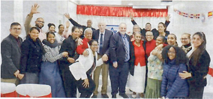
Some on the congregation in Spain