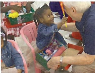
Delivering OCC shoe boxes in the Dominican Republic

With God's help and direction, CBC ended 2025 with 218 congregations in 14 countries on 4 continents. Five of these countries were added in the past year including Panama, Venezuela, Columbia, Spain and Ecuador. God is really growing us and several of these are new church plants.