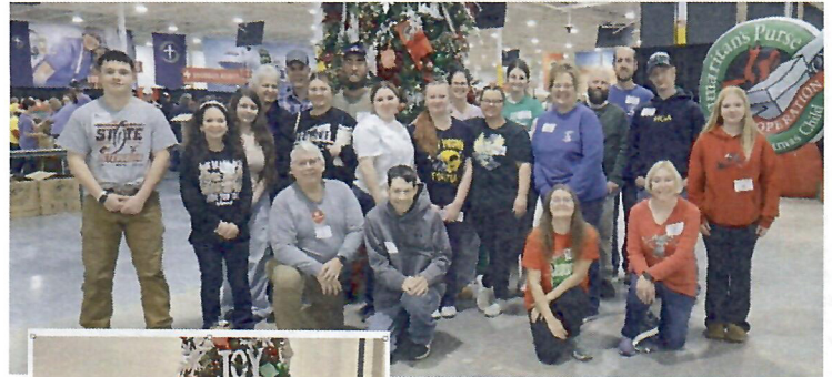
Some of the 80 volunteers who went to OCC processing centers.