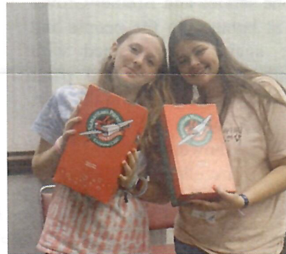
Youth packing shoe boxes at Annual Youth Conference

Graham. During this time of sharing, it became even more evident that our partnership with Samaritan's Purse is most beneficial for CBC and SP as we work together to build the Kingdom and provide for the needs of God's people.